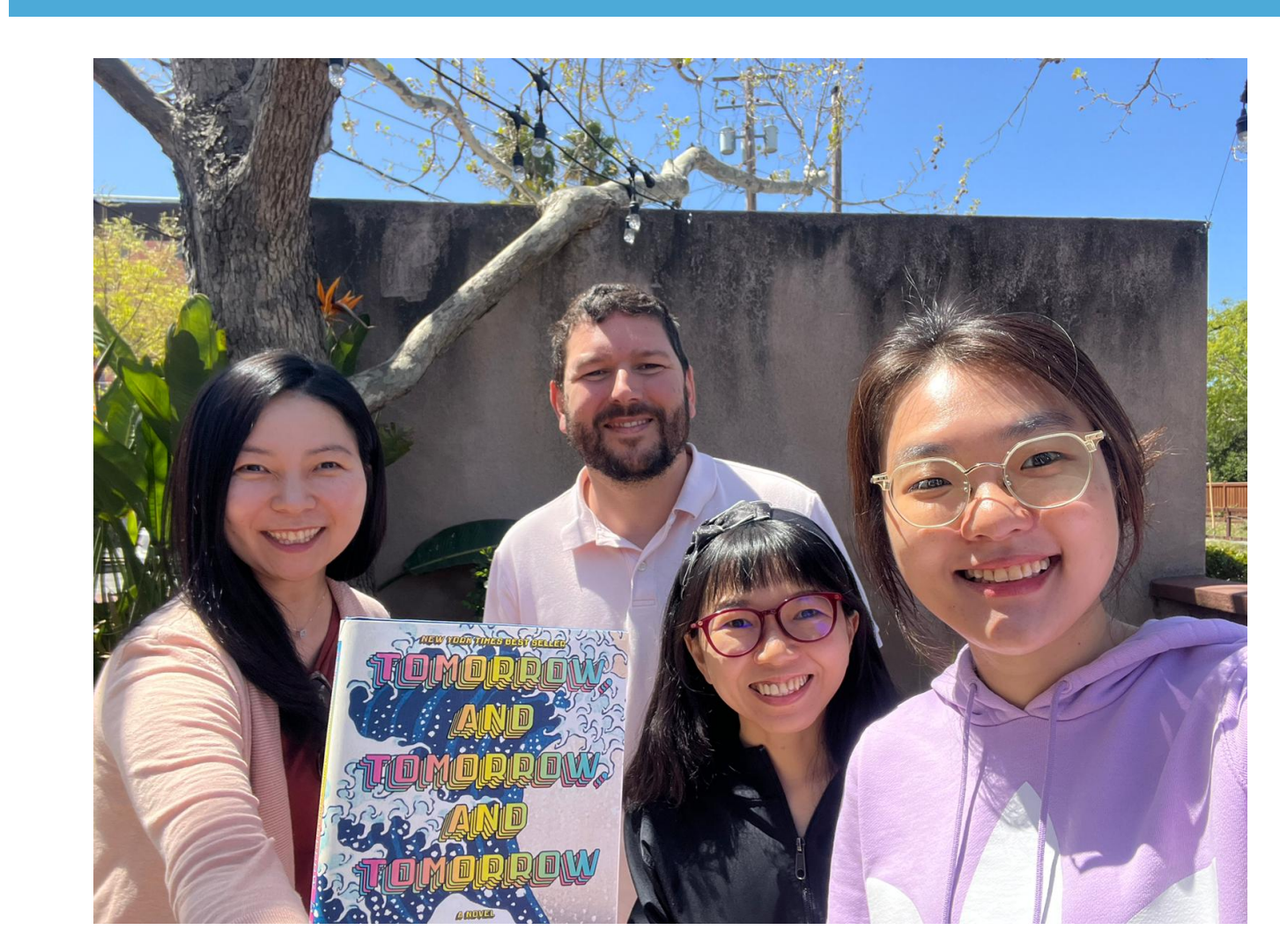
Let us read together! - The Book Club

Please let us know if you would like to write an article for a future newsletter.