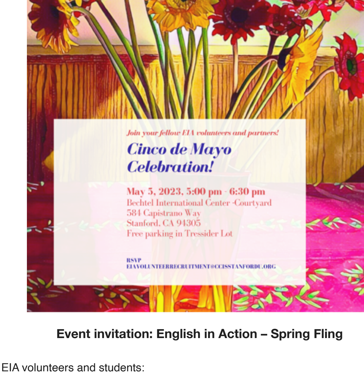
A special event for community volunteers and their international partners will be held on Friday, May 05, from 5:00 - 6:30 PM. Please come and enjoy

which I really enjoyed. For me, the stay in Stanford is and will always be a