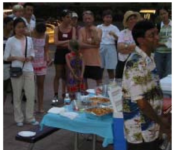
Homestay Hosts tell the crowd about the joys of hosting international students/scholars and, in turn, students talk about some of the cultural differences and comforting experiences with their homestay families.